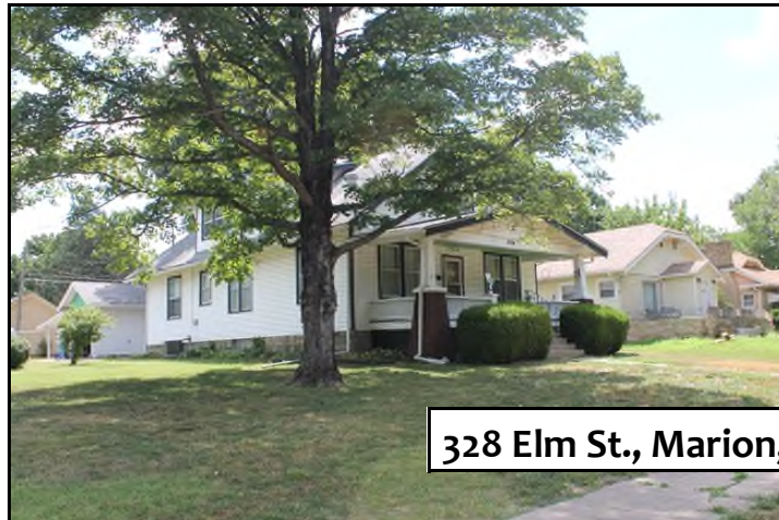
328 Elm St., Marion, Ks.

Terms: $3,000 Day of Auction as Earnest Money to be deposited with Security First Title. Balance in form of Certified Funds at time of Closing on or before October 27, 2017. Title Insurance and Closing Cost will be paid 50% by Seller and 50% by Buyer. 2017 taxes will be prorated at time of closing. 2016 taxes were $1,811.70. Buyer needs to have Financing in place at time of Closing, this Property is not selling subject to Buyer obtaining Financing. This Property is selling in its present existing condition no warranties expressed or implied by Seller or Auction Co. Triple K Auction & Real Estate is acting as Agent for the Seller.