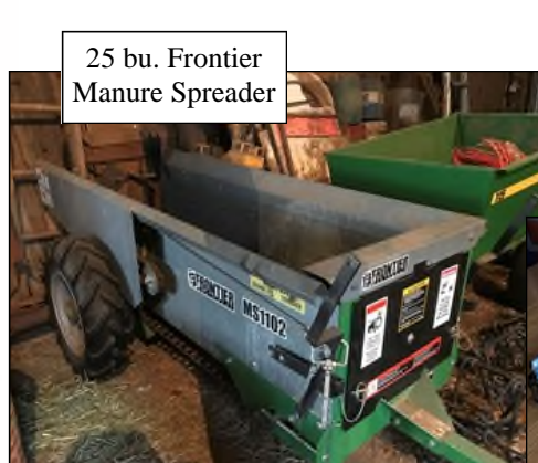
25 bu. Frontier Manure Spreader